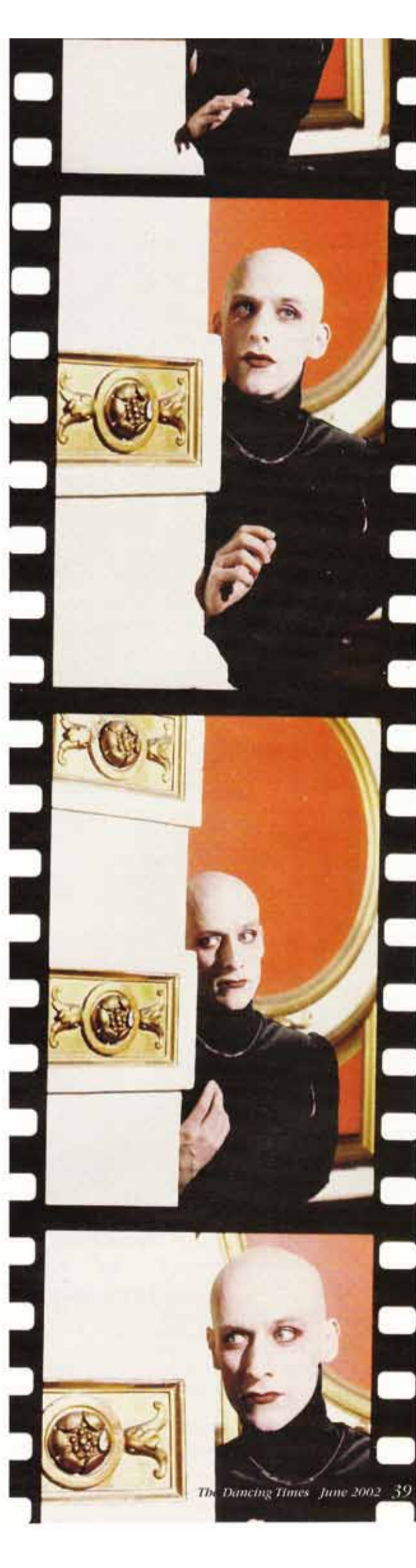
The Dancing Times June 2002 39